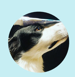
Brushing helps! We can help you find an appropriate brush and toothpaste!